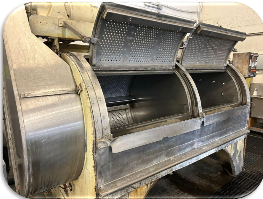
Figure 1 - Industrial Cruise Line Washing Machine

Insulating hoods undergo a laundering process in accordance with ASTM Standards to ensure compliance with safety regulations. Utilizing an industrial cruise line washing machine guarantees thorough cleaning, effectively removing all traces of streaks, stains, dirt, dust, oils, and other contaminants that may compromise the insulation properties of the hoods. Additionally, this cleaning process ensures the removal of any stamps and markings from previous test certifications, providing a clean surface for subsequent testing procedures.