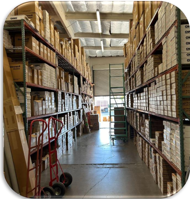
Figure 4 - Shipping or Pickup