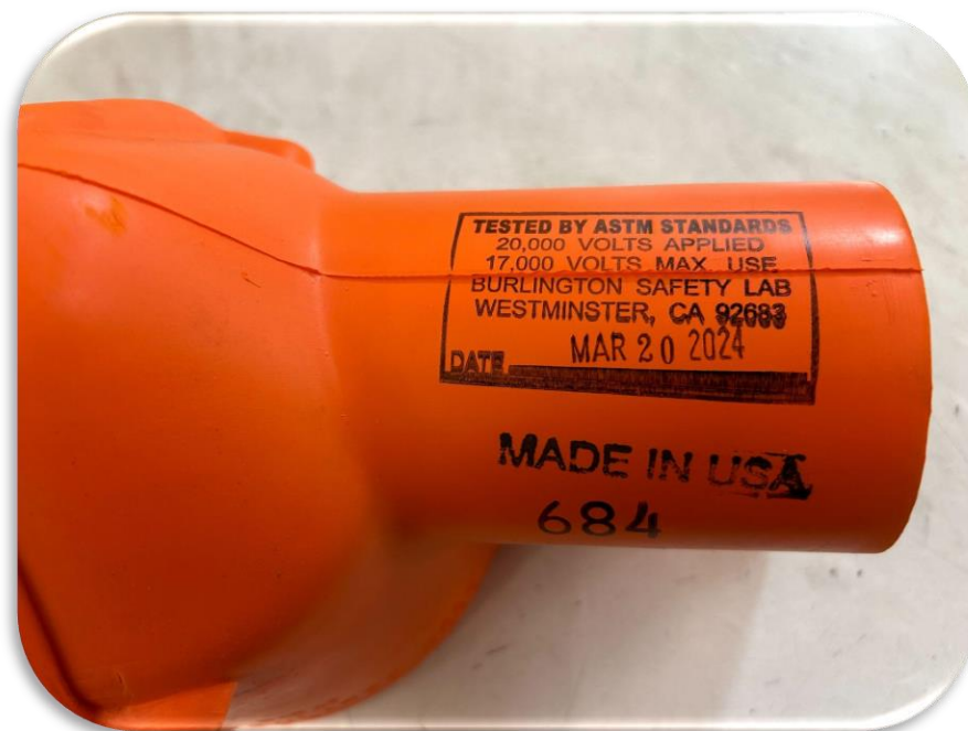
Figure 3 - Stamp

Each hood is then stamped with essential information including an identifying serial number, proof test voltage, maximum use voltage, and the date of testing completion. This stamping process enhances traceability and ensures that crucial information is readily accessible for each hood, facilitating effective monitoring of testing history and compliance with safety standards.